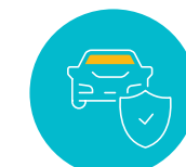
Transportation Safety Operations