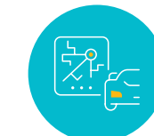
Regional Coexistence and Cooperation (Others)