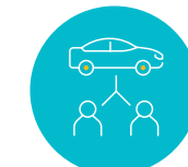
Support for Traffic Accident Victims and Their Families